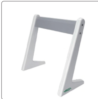
6-position linear stand (optional)