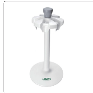
6-position round stand (optional)